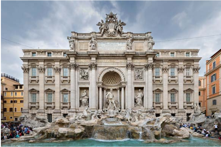
Trevi Fountain