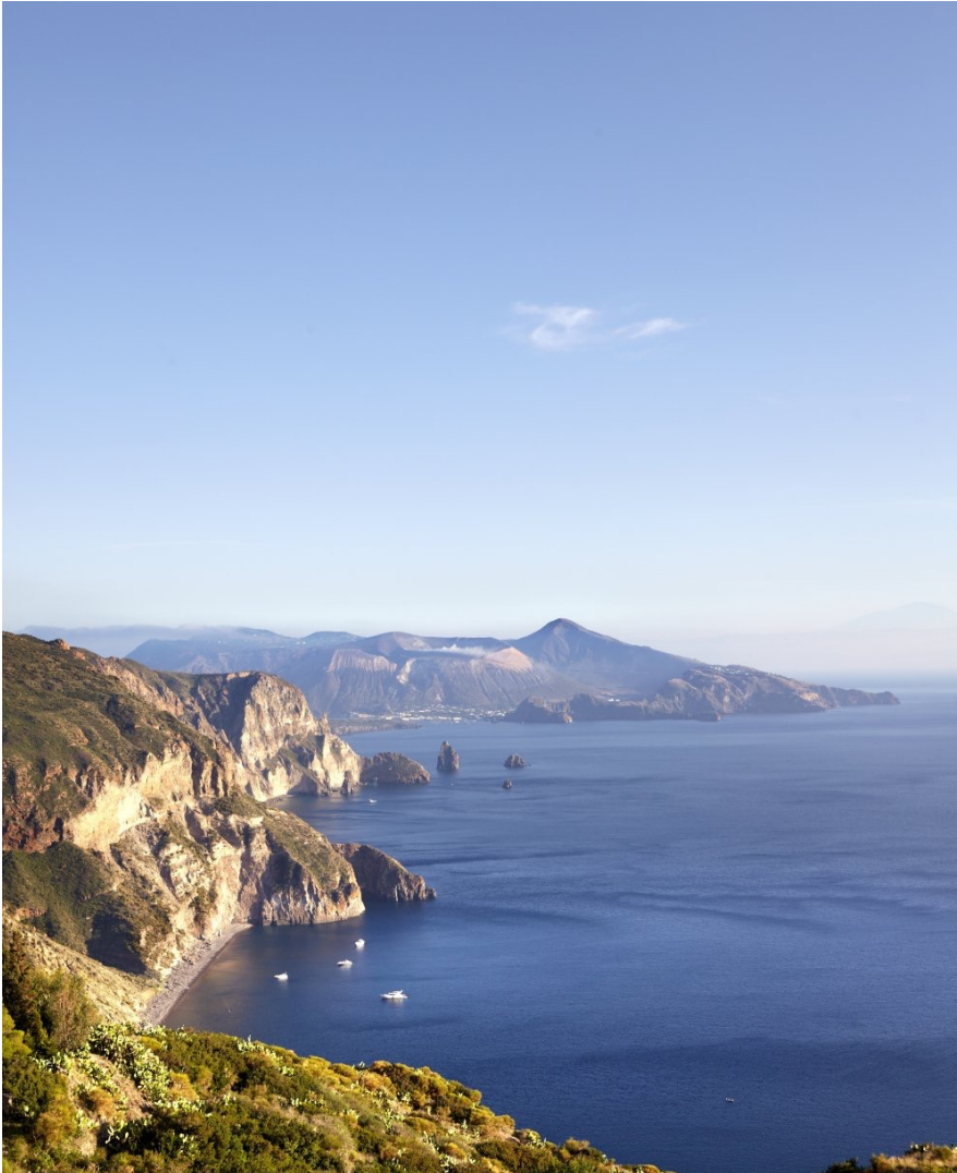
Sicilian coast

Get ready to travel back through time, Sicily is Italy's most famed island in the Mediterranean Sea. Its mild climate makes it popular tourism destination throughout the year.